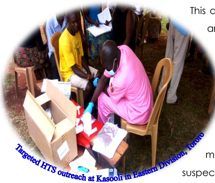
Targeted HTS outreach at Kasooli in Eastern Division, Tororo

This activity was implemented in the hotspot areas of Western and Eastern Divisions, Malaba Town Council and Osukuru Sub County of Tororo District. This increased access to HIV prevention services and identification of new HIV positives and linking them to care. A total of 734 KPs were mobilized, counseled, screened and 248 suspected of HIV were tested. 24 positives