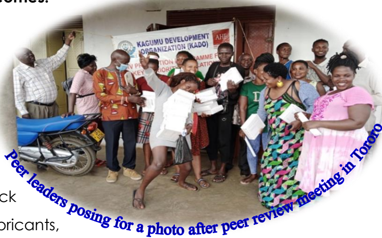
Peer leaders posing for a photo after peer review meeting in Tororo

A total of 22 participants attended the meeting. A progressive report was disseminated to the participants. Peer leaders pointed out that HIV prevention services are still inadequate i.e. lack of female and male condoms, lubricants, PEPs, PrEP, and self-test kits.