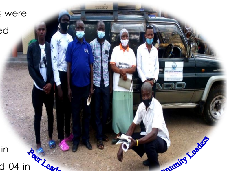
Peer Leaders posing for a photo with Community Leaders

A total of 20 out of 20 peer leaders were mobilized identified and selected from Western, Eastern Divisions, Malaba town council and Osukuru Sub County of Tororo district. The selected members were VHTs, CSWs, MSMs, WSWs, HIV Positive Population, with 07 selected in Malaba, 05 in Osukuru, 4 in western Division and 04 in eastern division.