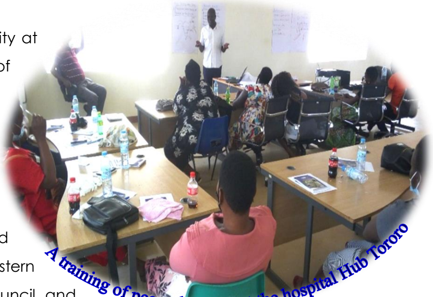
A training of peer educators at the hospital Hub Tororo

KADO conducted this activity at hospital Hub Tororo. A total of 20 out of 20 participants attended this training. The targeted participants were peer support group leaders, cultural and religious leaders selected from Western and Eastern Divisions, Malaba town council and Osukuru Sub County of Tororo district. District based trainers facilitated the training.