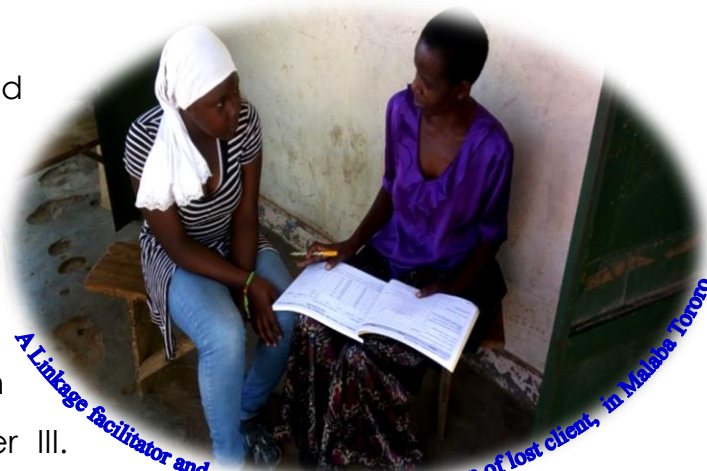
A Linkage facilitator and a client during the follow up of lost client, in Malaba Tororo

Data was collected using the Ministry Of Health approved tool and data reported through HMIS. In addition, physical tracking of the clients in their respective homes was conducted. A total of 256 lost clients were followed-up and returned to care and treatment.