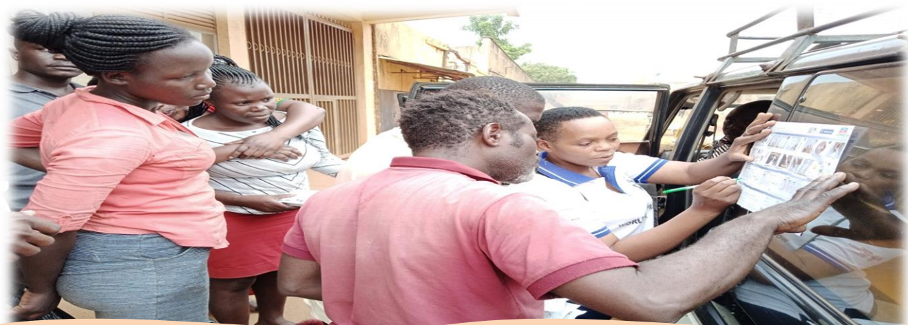
Educating KPs on use of self test kits in Western Division Tororo