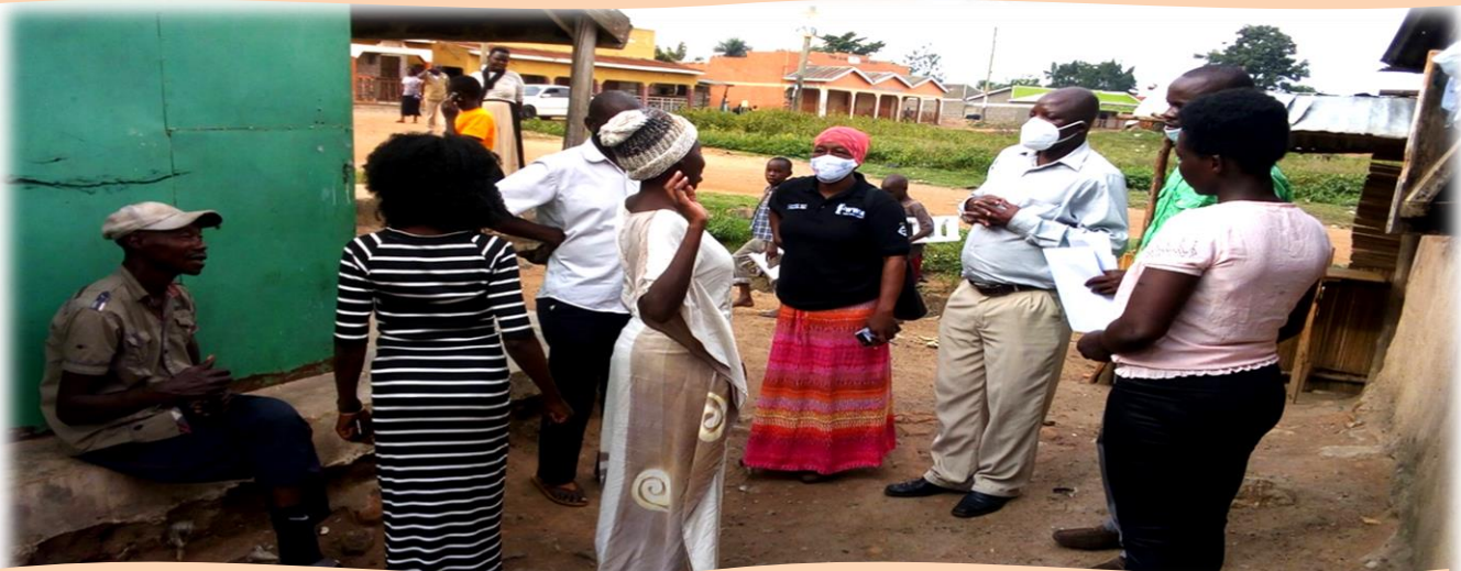
Out of school sensitization at Malaba Boarder