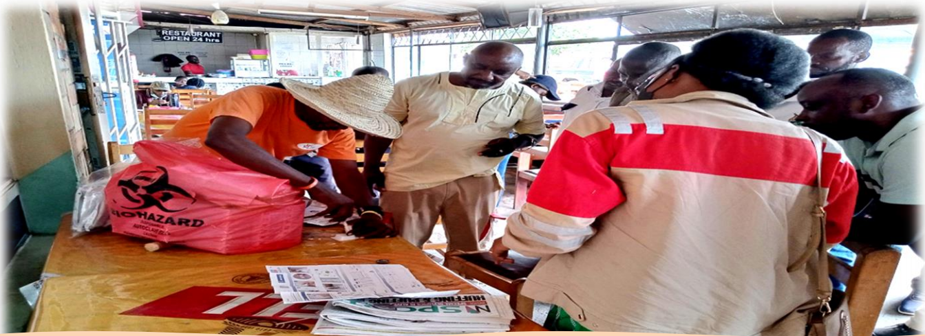
A Peer Leader demonstrating on use of self test kits among KPs in Malaba