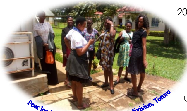
Peer leaders after coaching in western division, Tororo

20 peer support group leaders were supervised, mentored and coached. The mentorship was on linkage, follow-up, sensitization and mobilization for HTS and other HIV utilization. This equipped the peer educators with knowledge and skills of supporting in project implementation